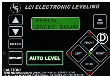
Fig. 3 Touch Panel - Unit Level