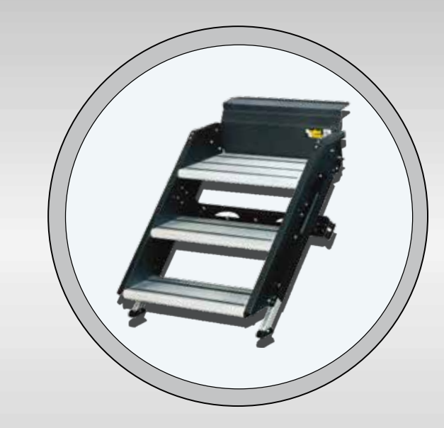
"SOLID STANCE" FOLD-DOWN STEPS