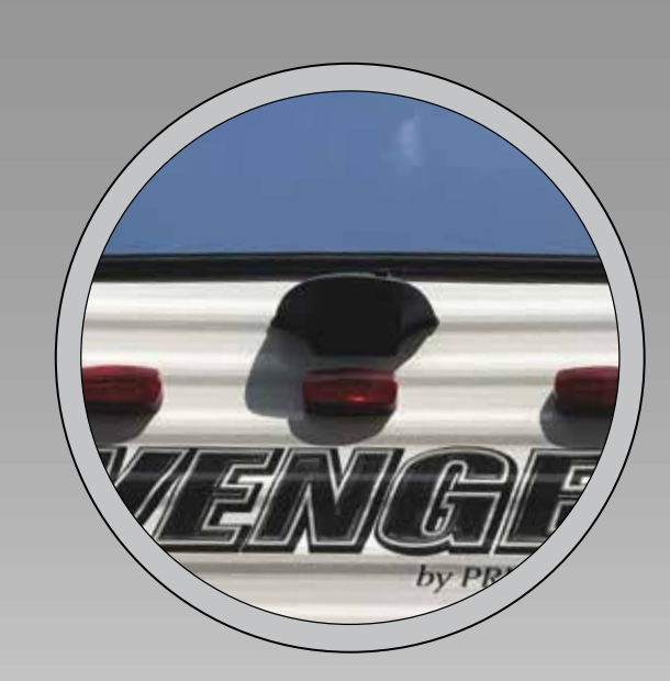
BACK UP CAMERA PREP