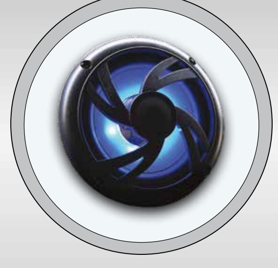
BLUE LED LIT OUTDOOR SPEAKERS