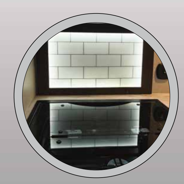
LED LIT KITCHEN BACKSPLASH