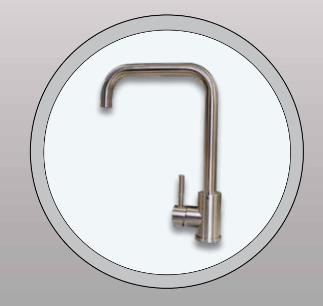
HIGH-RISE METAL FAUCET