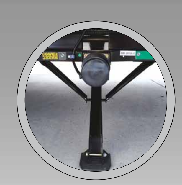
ELECTRIC STABILIZER JACKS (N/A ATI)