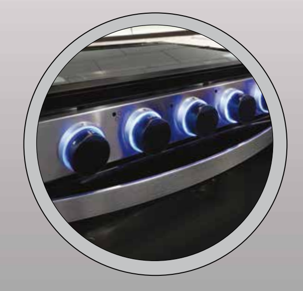
GLASS TOP STOVE WITH LED LIGHTING