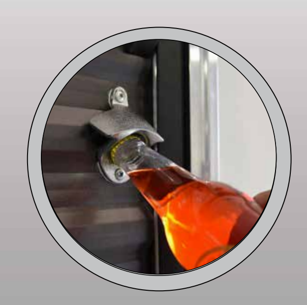
EXTERIOR BOTTLE OPENER