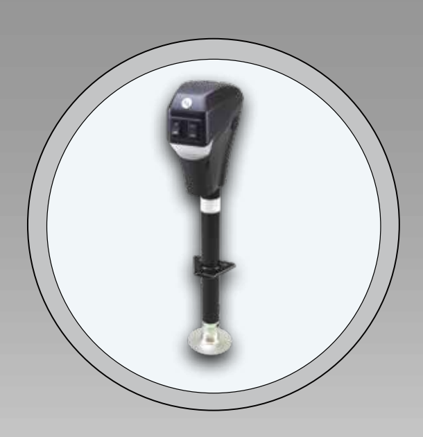
ELECTRIC TONGUE JACK (N/A ATI)